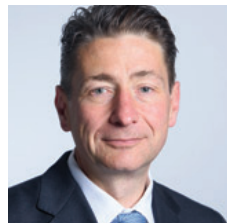
N. Forgó

Requirements: Regular attendance and active participation in class discussions (40%) and an open-book essay exam (60%).